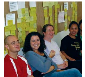
A SKILLED WORKFORCE